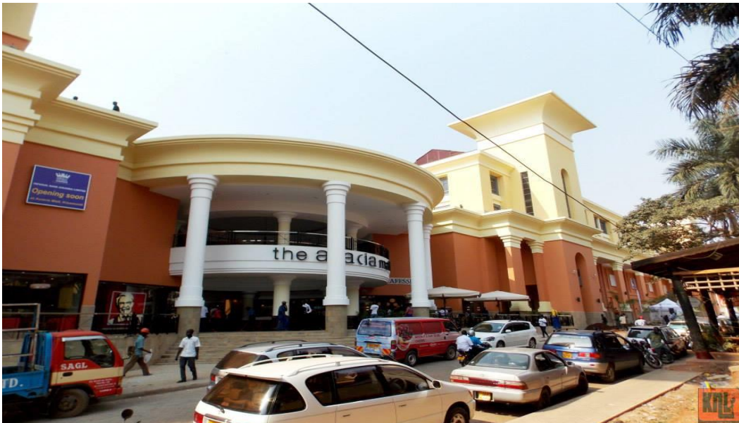
Acacia mall building

This is a mall targeting the Mzungu or international people. There are both shopping and eating places and you will need to navigate for your comfort spots. Acacia mall is right opposite the Acacia house and it is a five minute walk from the house.