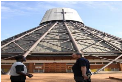
Uganda Matyrs Namugongo

This has over 200 floors and the view when you reach up is amazing!